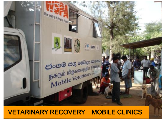
VETERINARY RECOVERY – MOBILE CLINICS