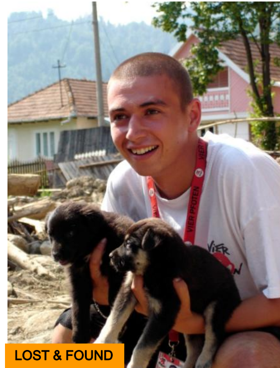
LOST & FOUND