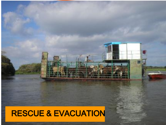
RESCUE & EVACUATION