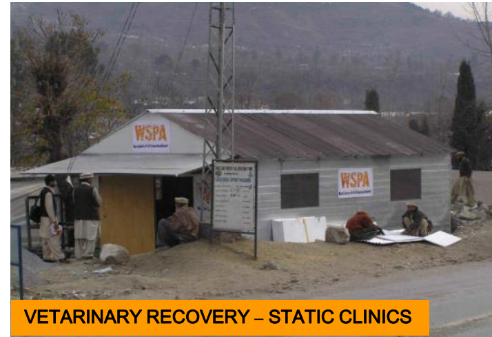
VETERINARY RECOVERY – STATIC CLINICS