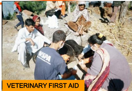
VETERINARY FIRST AID